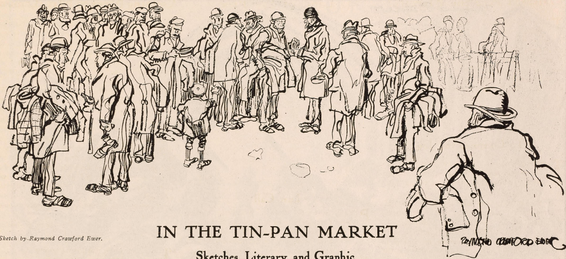
Sketch by Raymond Crawford Ewer.