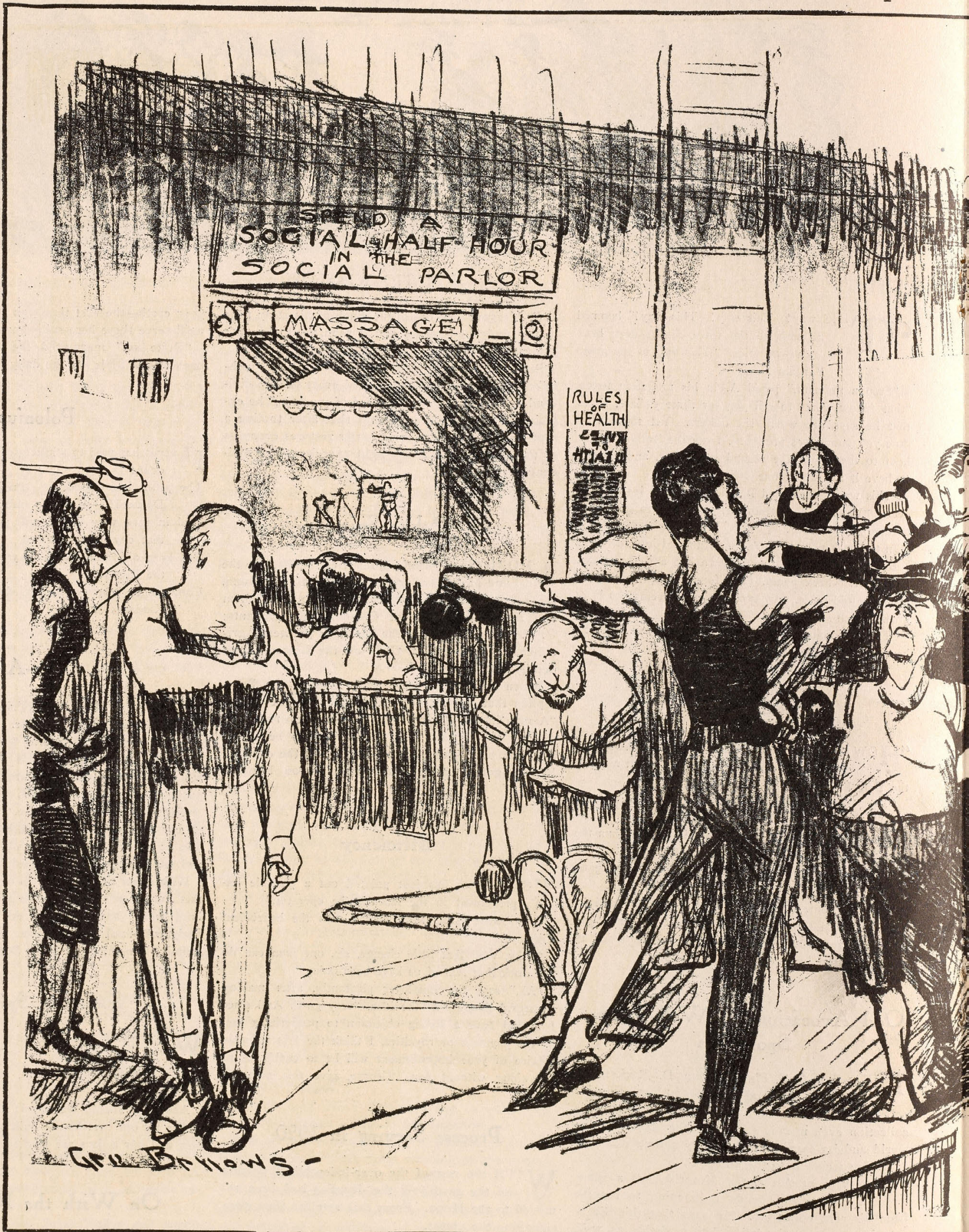
Drawn by George Bellows.