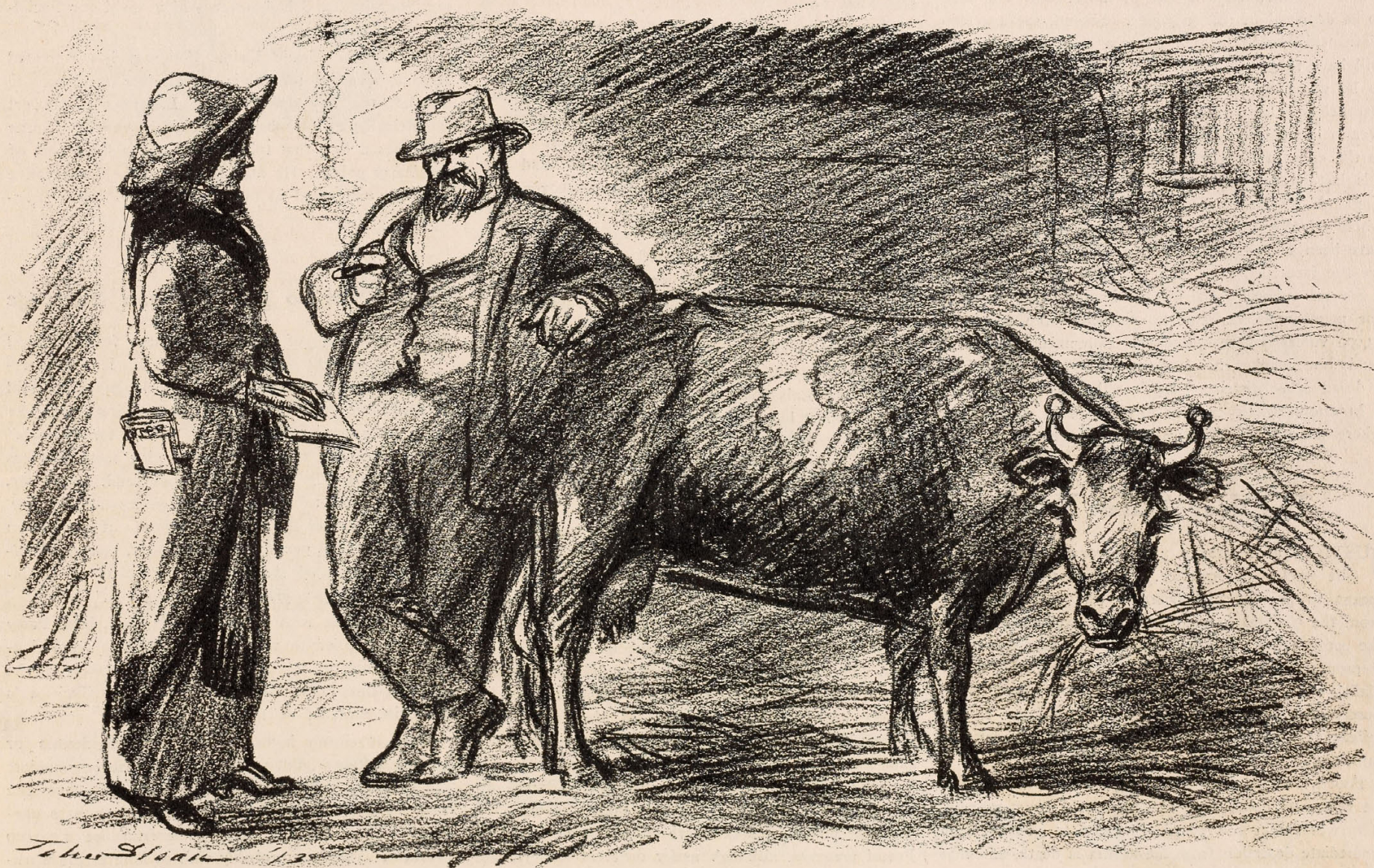
Drawn by John Sloan.