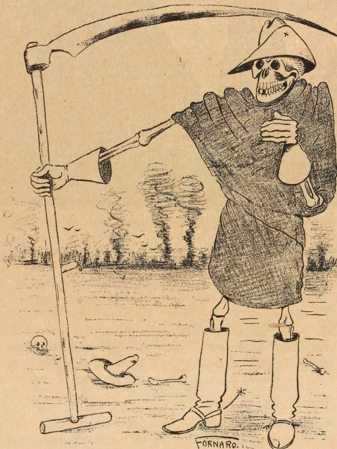
UNITED STATES INTERVENTION IN MEXICO.

The wisest thing for us to do is to stop discussing a thing which cannot and will not be done, unless the men at the head of this nation have gone completely mad. We had better gird our loins for a task that will keep us very busy right here for the next twenty years.